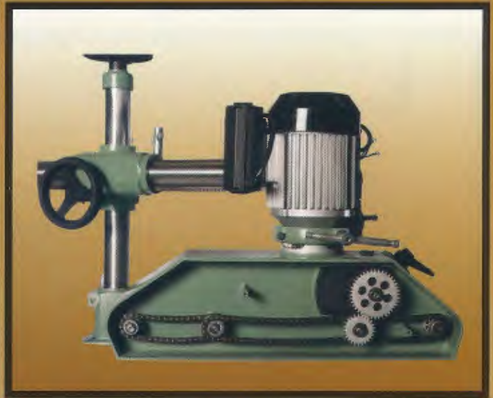
REAR VIEW SHOWING ROLLER FEED CHAINS AND STUD GEARS