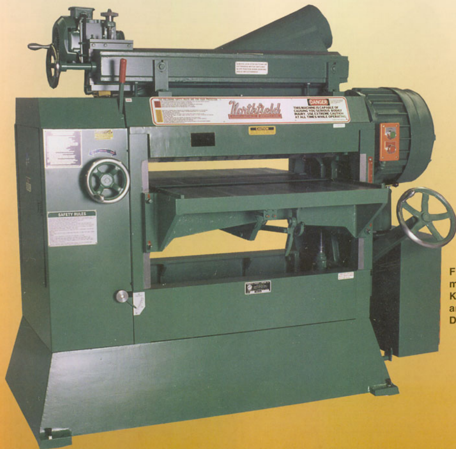
Front view of machine with Knife Grinder and Blower Type Dust Hood

Available with the Northfield Helical Carbide Cutterhead