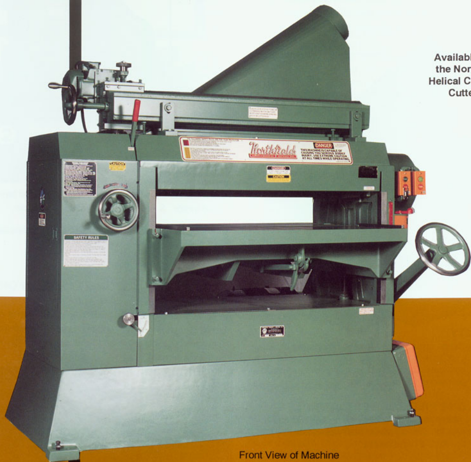
Front View of Machine with Knife Grinder and Blower Type Dust Hood

Available with the Northfield Helical Carbide Cutterhead