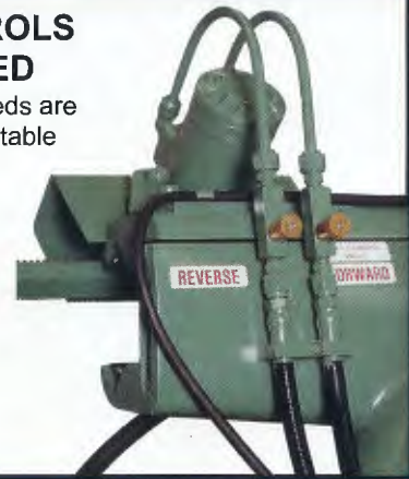
Drive shown with guard removed.

Cut and retract speeds are independently adjustable via conveniently mounted flow control valves. The feed rate is infinitely adjustable from a creep feed to 40 FPM.