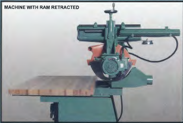
MACHINE WITH RAM RETRACTED