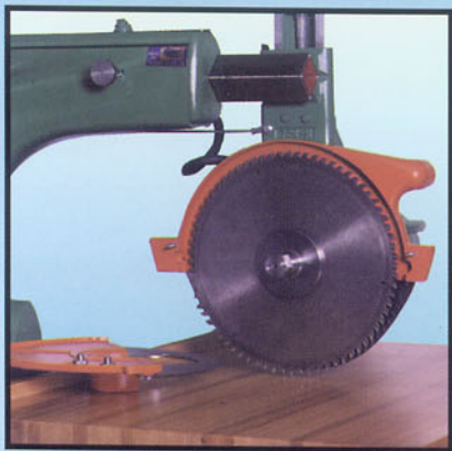
Photo shows the guard removed for blade changing