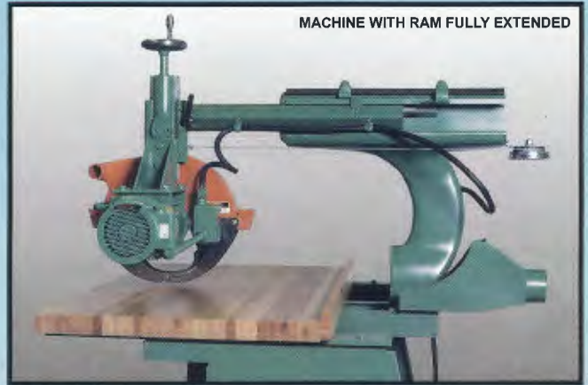
MACHINE WITH RAM FULLY EXTENDED