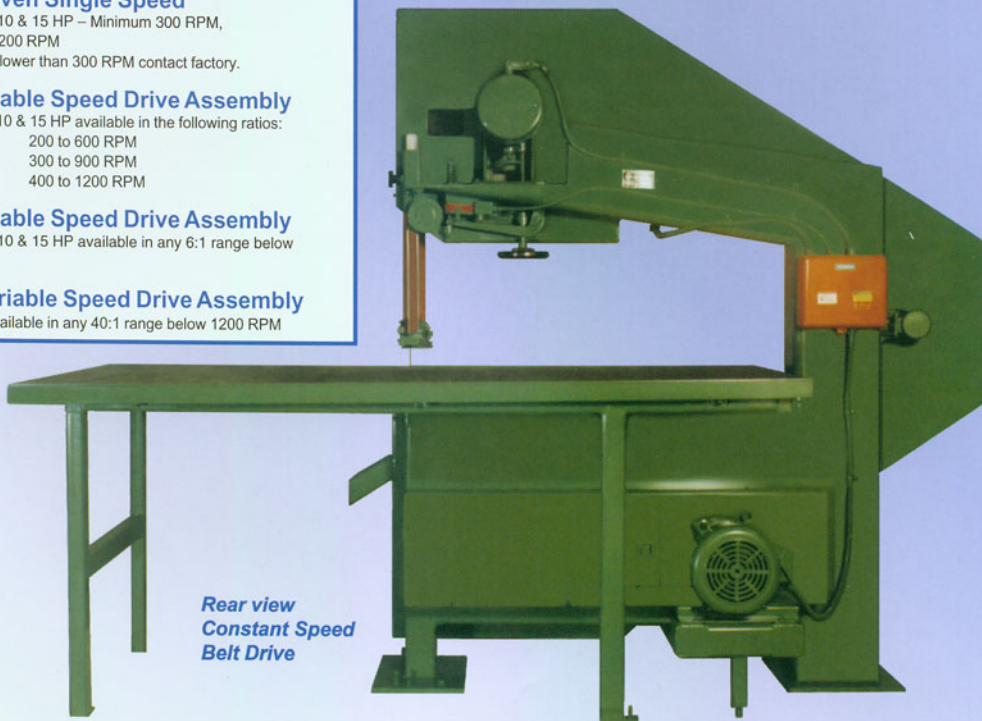
Rear view Constant Speed Belt Drive

3 & 5 HP available in any 40:1 range below 1200 RPM