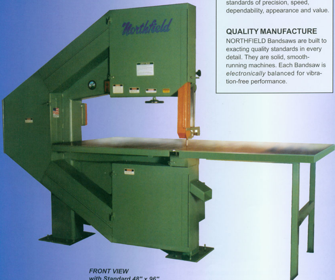
FRONT VIEW with Standard 48" x 96" Sheet Steel Table

NORTHFIELD Bandsaws are built to exacting quality standards in every detail. They are solid, smooth-running machines. Each Bandsaw is electronically balanced for vibration-free performance.