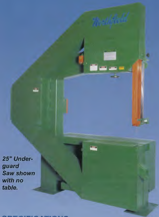
25" Under-guard Saw shown with no table.